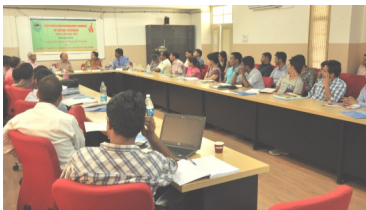
The ICSSR Workshop in Progress