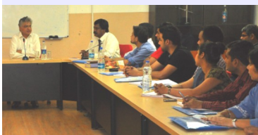
The Vice Chancellor Interacting with Participants

It was nice to interact with a set of enthusiastic faculty and research scholars. I wish this fledgling University a bright future!