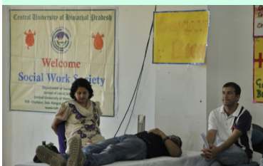
A student donating blood on the occasion of 10th World Donor Day 2013

The programme was undertaken on the request and under the supervision of Chief Medical Officer (Kangra), Dharamshala, H.P.