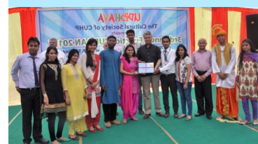
The Winners with the Vice Chancellor and other Dignitaries