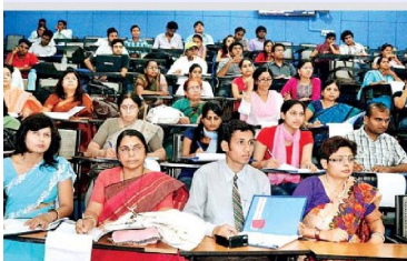
Students at the Workshop @ MNIT Bhopal

Research Degree Scholars of Computational Biology and Bioinformatics participated in a five-day National Workshop on Bioinformatics under Bioinformatics Infrastructure Facility of Department of Biotechnology and Special Interest