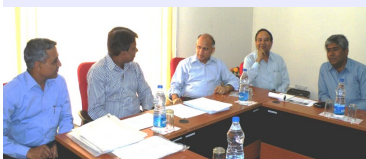
The MHRD Commission Meeting in Progress