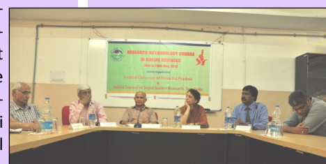
Inaugural Function of the Workshop on Research Methodology