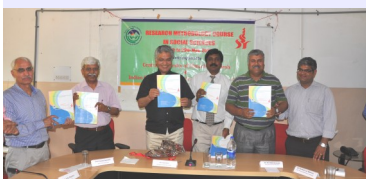
The Vice Chancellor Releasing the Compendium on Research Methodology