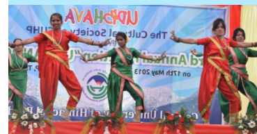
The Cultural Extravaganza that Mesmerized the Audience