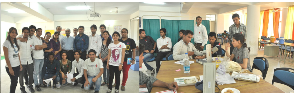
Volunteers & Faculty pose for a Photograph during the Blood Donation Camp

Vacancies for non teaching positions like Controller of Examination, Librarian and Deputy Librarian were also published.