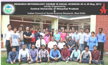
Group Photograph of Participants Attending the ICSSR Workshop

"It is interesting to visit CUHP, Dharamshala. I had great pleasure to interact with the participants of Methodology Workshop. The University is progressing day by day as I had a visit three years back. It has a bright future!!"