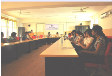
Media Society Workshop in Progress

Media Society conducted a workshop on 'Changing Contours of Journalism Practices and Regulation in the Internet Age', at the university campus on Tuesday, 21 st May 2013.